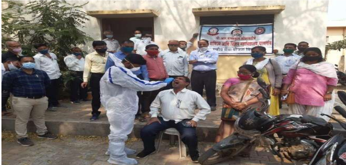
17/02/2021 Corona inspection camp