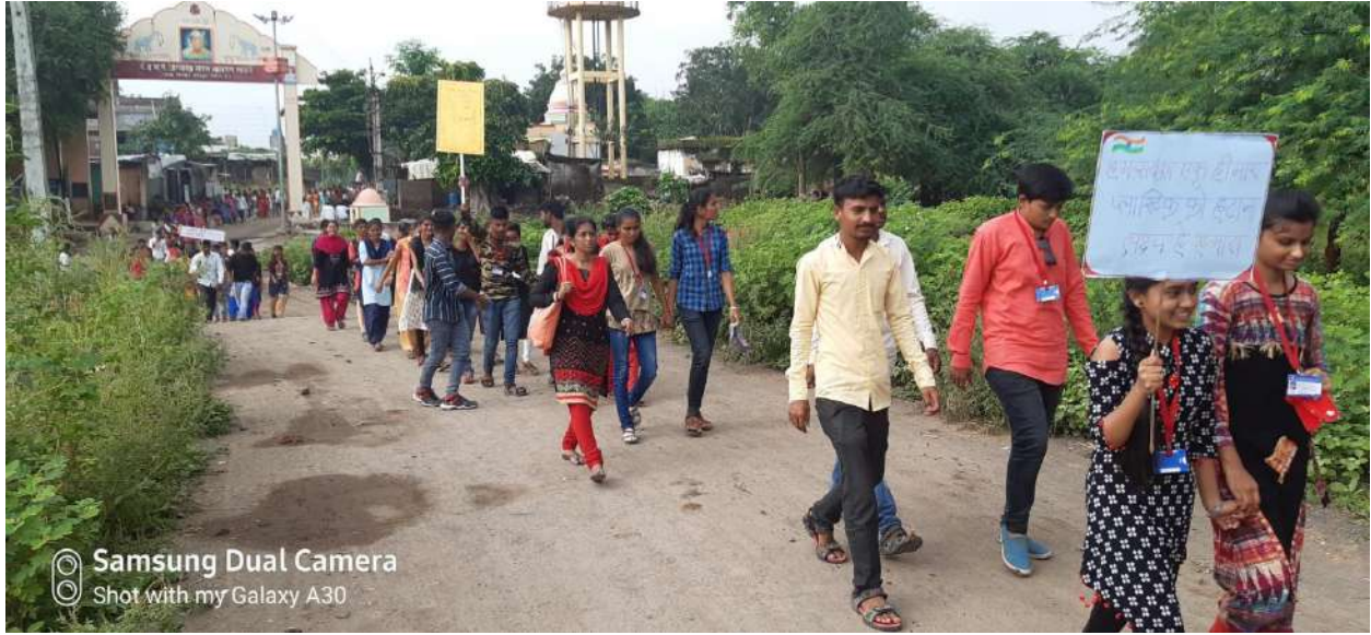
Samsung Dual Camera Shot with my Galaxy A30